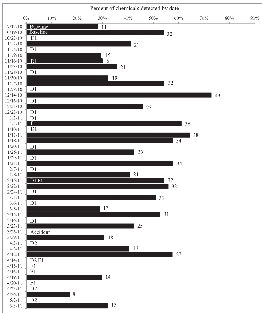
Figure 1. Percent and number of chemicals detected in air samples collected in western Colorado from July 2010 to October 2011, and drilling/fracturing events, by date. The number of chemicals detected is shown at the end of each bar. D1 F1: Drilling and fracturing events during development of Pad #1. D2 F2: Drilling and fracturing events during development of Pad #2. D3 F3: Drilling and fracturing events during development of Pad #3.

correlation between detected emissions (which varied by quarter and were highest in the winter) and wind direction.